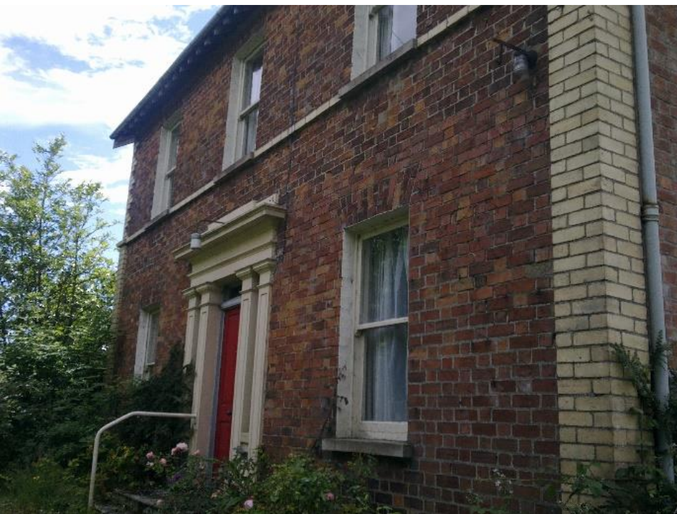
Picture: Navigation House, Union Locks, Lisburn

The history of the Lagan Navigation links in Northern Ireland go back over 250 years and were one of the main transport modes for many decades. The plans to reopen the Lagan canal and river are well underway and extensive research has been carried out to determine the best way forward.