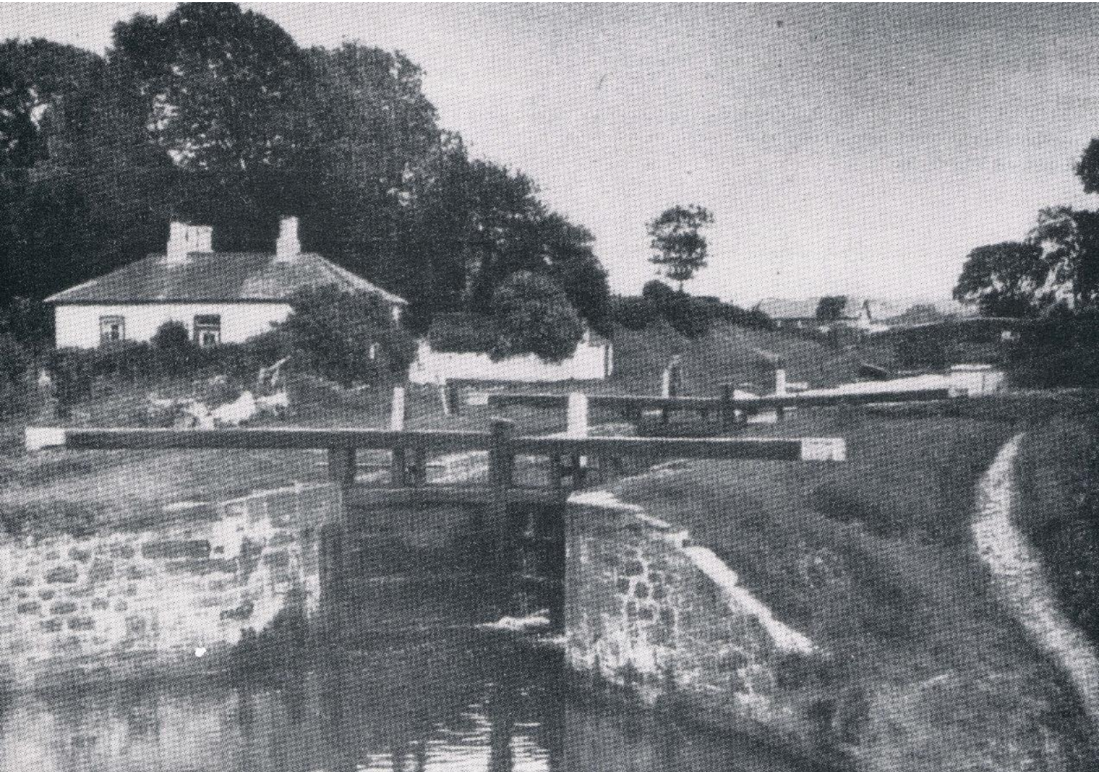
Picture: Lock Gates Union Locks Lisburn